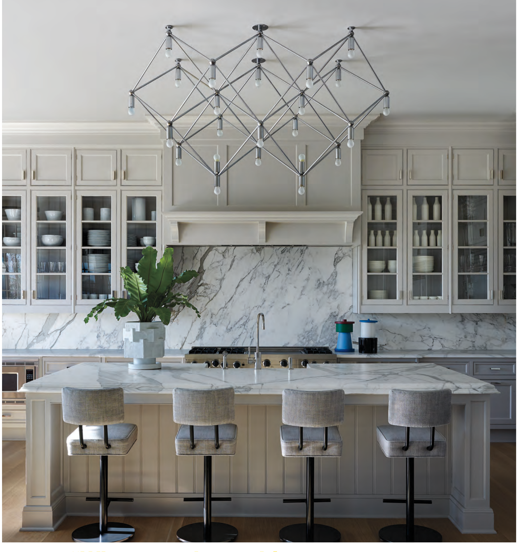
"Whatever the architecture, you can update a room with a fresh coat of paint and a single statement piece"